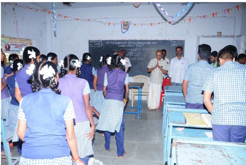
“DEAR STUDENTS – WHETHER I CAN GO BACK TO U.S.A & TELL TO ALL OF MY FRIENDS (INDIANS IN USA) THAT INDIA WILL SHINE ONE DAY THROUGH RURAL STUDENTS LIKE YOU AS DREAMT BY VIVEKANANDA AND GANDHI”