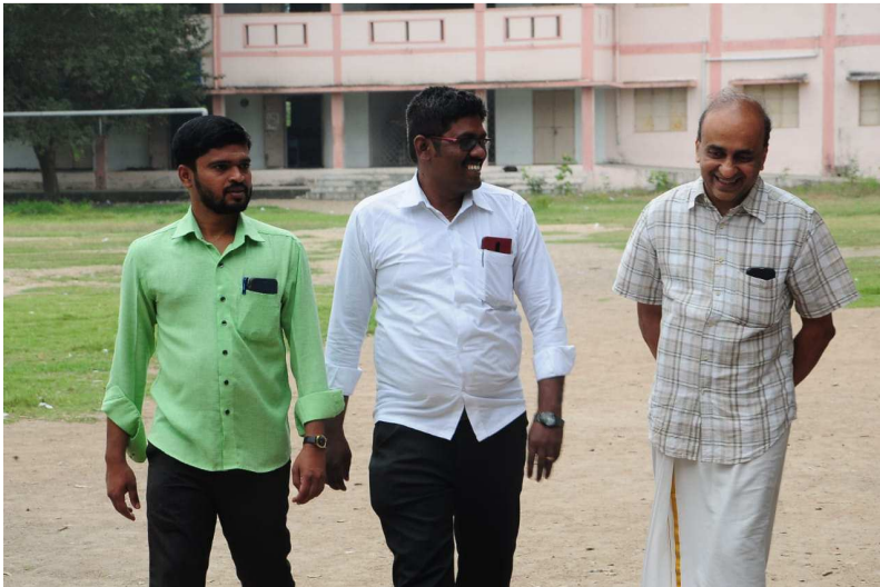
DISCUSSING WITH MANAGING TRUSTEE ABOUT RURAL TUITION CENTRES AND RURAL COMPUTER CENTRES IN VANDAVASI AND CUDDALORE