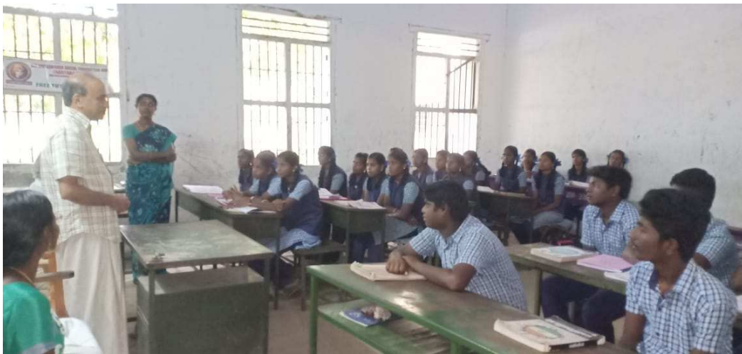
PROF. ADDRESSING THE +2 STUDENTS OF KILKODUNGALUR