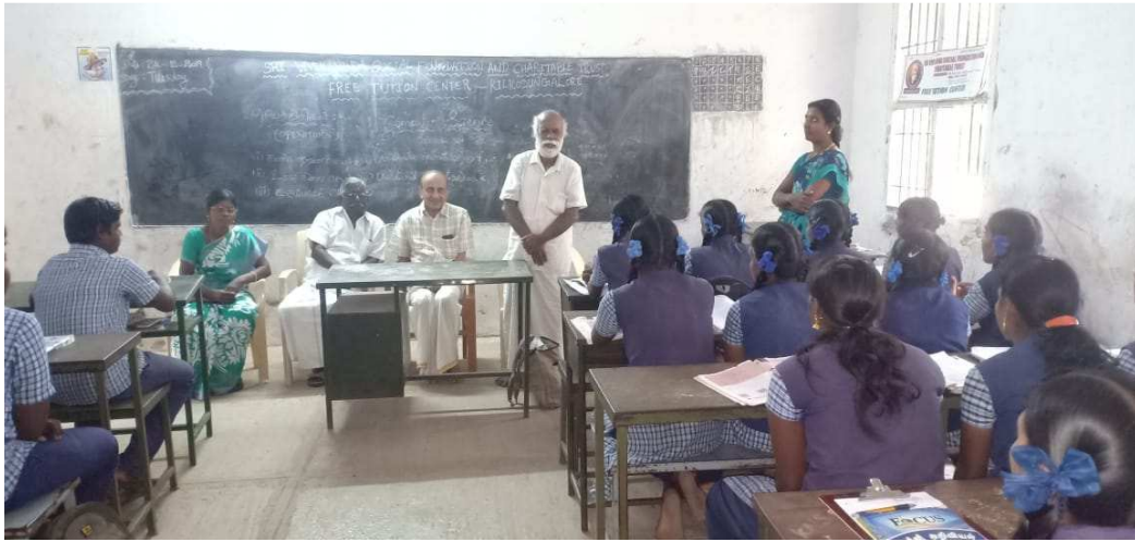
INTRODUCTION TO THE +2 STUDENTS OF KILKODUNGALUR