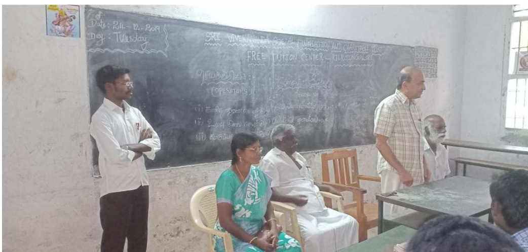
EXPLAINING A POINT (KILKODUNGALUR)