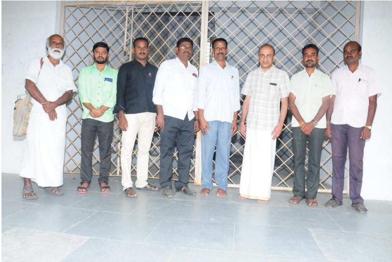
POSING WITH YOUNG SOLDIERS OF OUR TUITION CENTRES ALONG WITH SCHOOL H.M